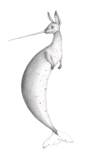
Figure 2. Artist Unknown, Gnarwhallaby Icon