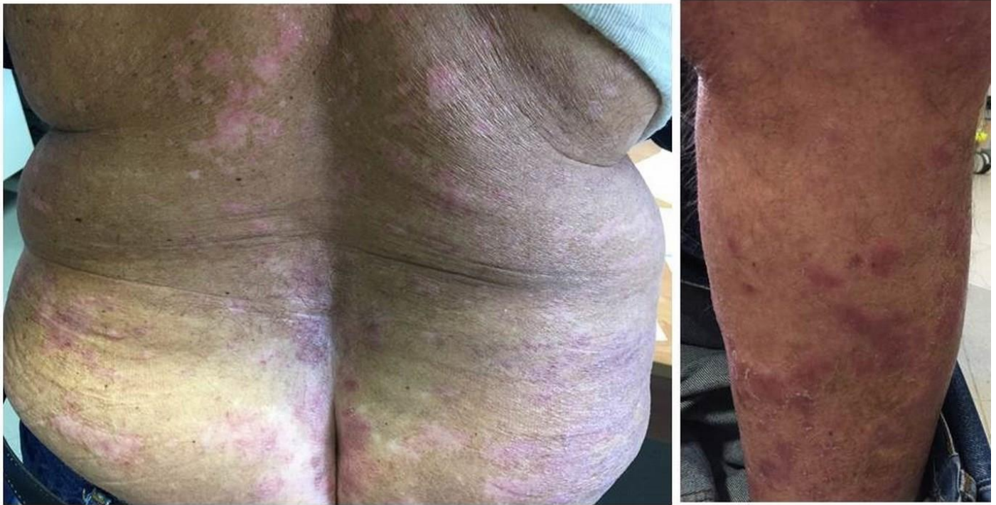
Figure 2. Psoriasis relapse after etanercept discontinuation, treated with methotrexate IM 15 mg/week with partial improvement

Dermoscopy showed a compound pattern: an irregular network, de-structured central areas partially covered by grey-whitish veil, radial streaks, pseudopods, and marginal brown globules. Surgical excision produced a histologic diagnosis of superficial spreading melanoma (Figure 1): Breslow thickness 1.2 mm, one mitosis/hpf, no vascular or neural invasion (stage T2b). Sentinel lymph node biopsy was negative. Investigation for melanoma risk factors was unremarkable: normal total nevus count, photo type IV skin, no childhood sunburns, nor family history of melanoma. The medical chart reported mild hypertension, and atrial fibrillation treated with daily 5 mg enalapril, 8 mg doxazosin, and 250 mg ticlopidine. His psoriasis diagnosis dated back to 2000 and was controlled with topical therapy and cycles of oral retinoids. Periods of methotrexate use up to 15 mg/week were required at times. The use of etanercept had produced a sustained remission. Owing to melanoma, etanercept was dismissed and a slow, but progressive relapse of psoriasis and psoriatic arthritis occurred (Figure 2). Methotrexate treatment was reintroduced at 15 mg subcutaneously once weekly, with slow, but sustained improvement.