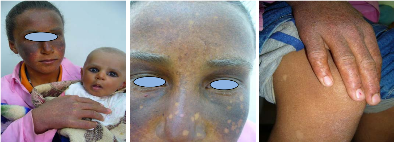
Figure 1,2,3. Silvery gray to golden hue of hair over the scalp, eyebrows, and eyelashes. Silvery sheen over most of the body hair. Brownish-black pigmentation of the skin over the sun-exposed sites, especially on the face, neck and extensor aspects of the upper and lower limbs. Generalized hypopigmentation of covered body parts. The younger sibling had same clinical presentation.

and extensor aspects of the upper and lower limbs. The skin in the covered areas of the body was comparatively light colored. Ophthalmological examination revealed a visual acuity of 7/10 (both eyes). Examination of the fundus revealed mild vascular sheathing with features of papilledema. EEG was done and was abnormal. The magnetic resonance imaging of the brain revealed abnormalities. Immunologic studies included serum IgG, IgA, and IgM., Phagocytic function was tested with nitroblue tetrazolium and was within normal limits. Routine laboratory tests were within normal limits. Serological screening for connective tissue disease was negative. HIV and HBsAg serology were negative. Skin biopsy specimens observed by light microscopy showed irregular distribution and irregular size of melanin granules in the basal layer (Figure 4). Microscopic analysis of her hair showed melanin clumps irregularly distributed along the hair shafts. Chédiak-Higashi syndrome and Griscelli syndrome were excluded in the analysis of our patient for the following reasons: there was no clinical or laboratory evidence of immunologic impairment and abnormal giant intracytoplasmic granules in neutrophils could not be found in the peripheral blood smear (Table 1).