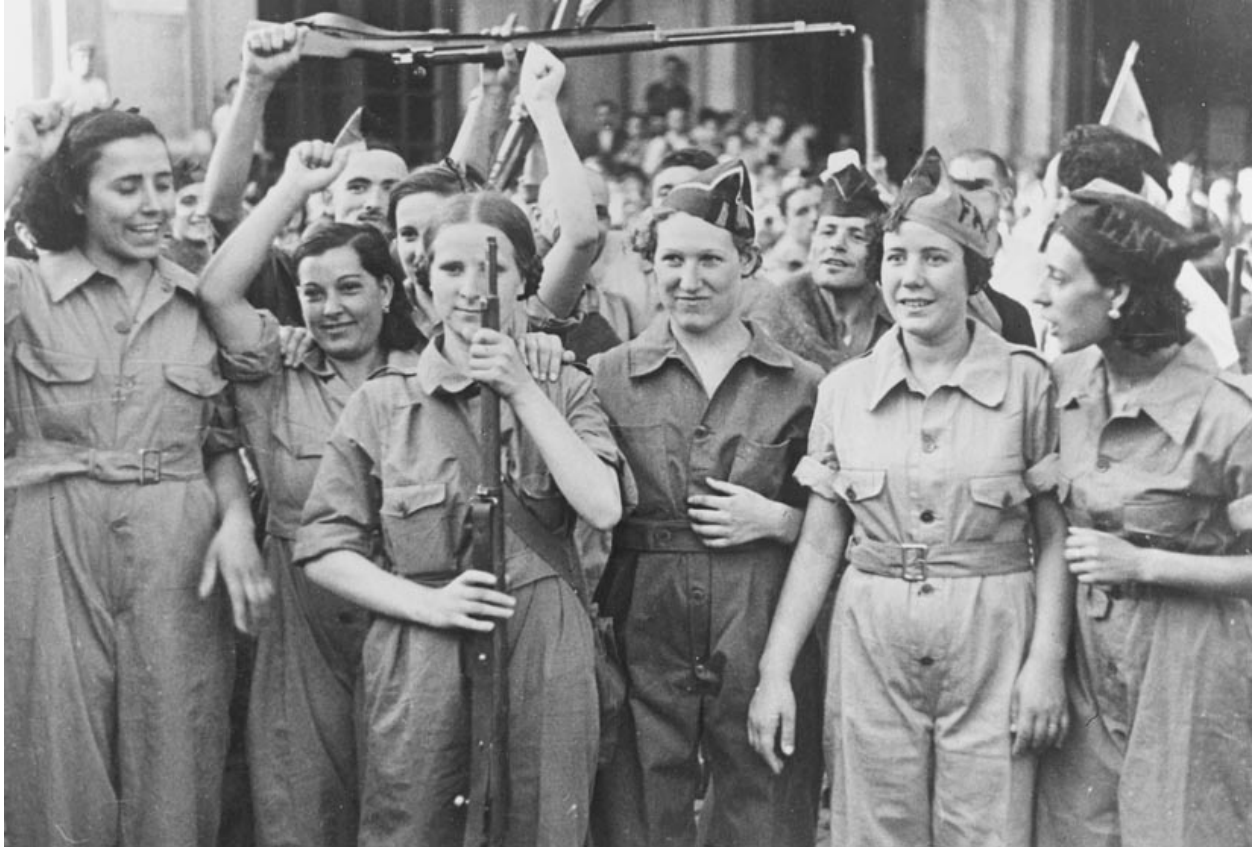
Figure 3: A group of milicianas, likely Barcelona 1936. Note the caps of the CNT-FAI on the women at right and their male comrades behind them.