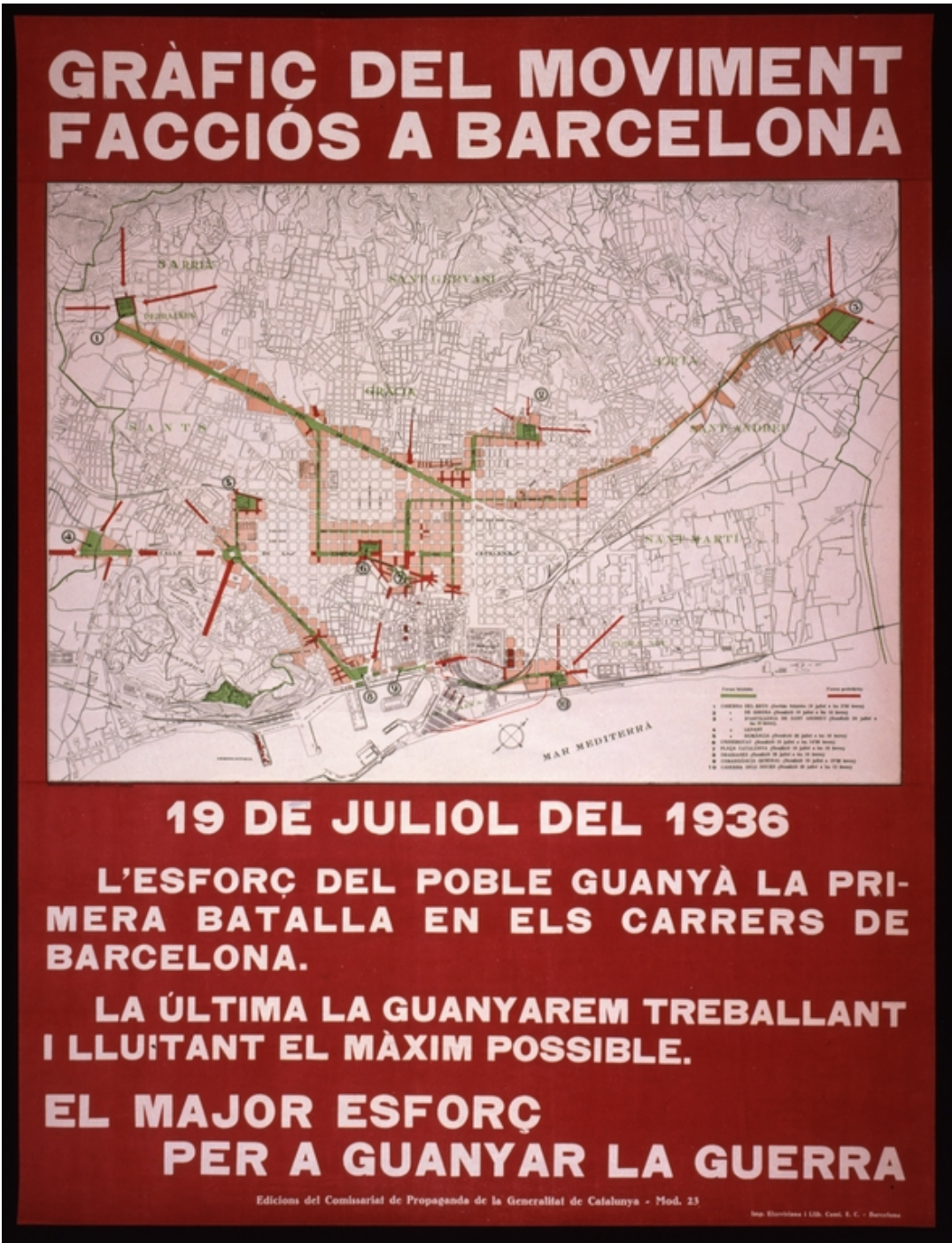
Figure 1: Gràfic del moviment facciós. 19 de juliol del 1936 (Diagram of the insurgent movement. July 19, 1936). This propagandistic map of Barcelona shows the military uprising and its repulsion by Republican-allied forces, predominantly the CNT-FAI. Red areas show forces feixistes (fascist forces, i.e. Nationalists) and green areas show forces proletòries (forces of the proletariat), with arrows indicating movement. Las Ramblas can be seen between (7) Plaça de Catalunya and the port. Note the upper and lower occupation of Las Ramblas by Nationalist forces and the density of the old city, particularly the Barri Gòtic to the east. Comissaria de Propaganda de la Generalitat de Catalunya, 1936.