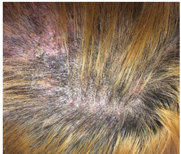
Figure 1. On examination, the patient had broad patchy alopecia with yellow scale and excoriated erythematous papules. A fungal culture isolated Trichophyton tonsurans .

A 38-year-old Hispanic woman presented with a pruritic full body rash and patchy alopecia of three years' duration. The patient's medical history was remarkable for chronic hepatitis C, cryoglobulinemia, diabetes mellitus type I, and end stage renal disease on dialysis. On physical examination, she had widespread, somewhat gyrate, erythema. On the nape of the neck and the scalp, she had broad patchy alopecia with yellow scale and excoriated erythematous papules ( Figure 1 ).