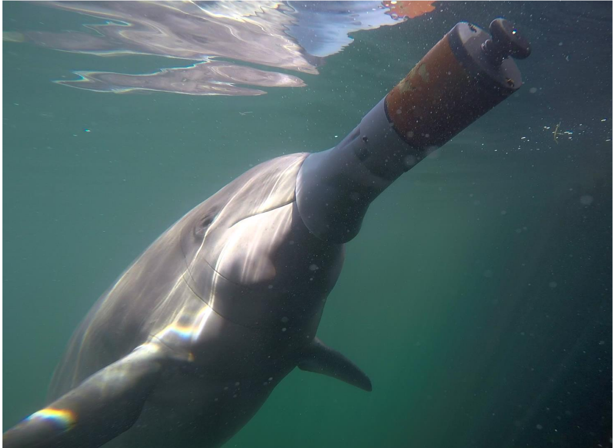
Figure 2. View from a camera near the far-field hydrophone during swimmer marking trials. A dolphin temporarily places its rostrum inside a swimmer marking device, a cone (nose cup) attached to a buoyant marker, used to identify the location of a swimmer.

was then presented with a swimmer marking device comprised of two parts that disassembled when SPL made contact with the swimmer. The first part was a cone that the dolphin was trained to insert its rostrum into. The second part was attached to the cone and upon contact with the swimmer separated from the cone and floated to the surface, allowing the location of the swimmer to be identified (Figure 2). Once SPL was given the marker, she relocated the swimmer and began her approach. Upon marker deployment, SPL returned to the boat, completing the chain of behaviors and received reinforcement.