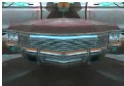
Excerpts from several Media Mural Project videos

Despite the huge learning curve they faced, the videos and original music produced during phase one were good and reflected a wide range of interests. The topics included war and evil behavior; product rip-offs; reasons not to join a gang and why people do; going to jail and dying as the only future for gang bangers;