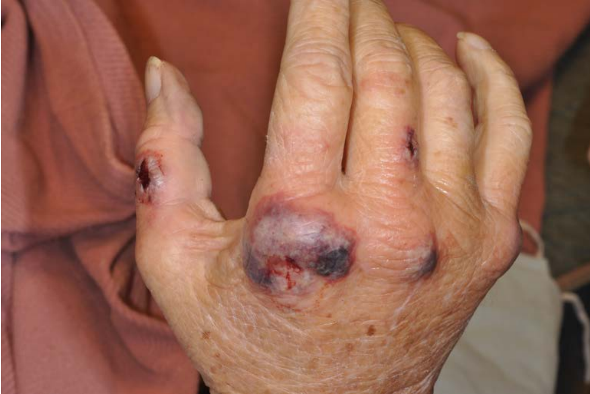
Figure 1. Violaceous vesicopustules with larger tense hemorrhagic and pus-filled bullae

Examination revealed bilateral small tender violaceous vesicopustules admixed with larger tense hemorrhagic and pus-filled bullae located primarily on the dorsal surface of his hands and extending to the forearm and palm (Figure 1). His hands were edematous with diminished range of motion. Labs revealed a neutrophilic leukocytosis (white blood cell count 16.6 \text{ k/mm}^3 ). Culture and gram stain of the hand lesions returned negative. Punch biopsies of the lesions were performed and revealed papillary dermal edema with a heavy neutrophilic dermal infiltrate; mild leukocytoclasia was also present (Figure 2). The histopathological findings along with negative culture and gram stain led to a diagnosis of neutrophilic dermatosis of the dorsal hands (NDDH).