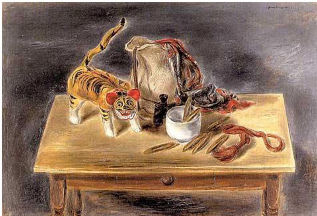
Figure 2. Yasuo Kuniyoshi, Japanese Toy Tiger and Odd Objects (1932). Oil on canvas.

in this case, in the year of the tiger. The tiger is additionally a symbol of strength associated with the May Boys' Day festival in Japan. Scattered along the foregrounded section of the table are a handful of cigars, alluding to the American tradition of a father handing out cigars upon the birth of a son. 19 Using folk objects connected to parallel traditions in both Japan and the United States, Kuniyoshi creates a personal iconography to express himself. Combining cultural symbols and imbuing them with meaning from his own experience, Kuniyoshi situated himself as straddling American and Japanese identities through artistic representation.