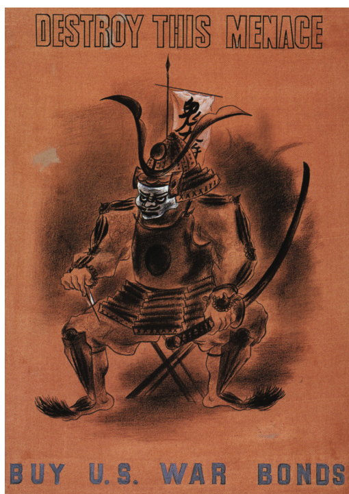
Figure 4. Yasuo Kuniyoshi, Destroy this Menace , OWI Poster Design.