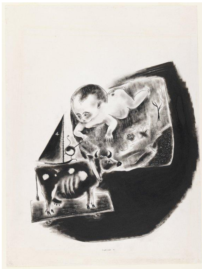
Figure 3. Yasuo Kuniyoshi, Baby and Toy Cow (1921). Ink on paper.

Despite his recognition as an American artist, Yasuo Kuniyoshi remained excluded from American citizenship, a position exacerbated after Roosevelt declared war on Japan following the attack on Pearl Harbour in 1941. 22 Exclusionary laws made all Asian immigrants ineligible for naturalization, and Kuniyoshi's status changed from "resident alien" to "enemy alien." 23 In a letter to fellow artist and friend, George Biddle, Kuniyoshi reflected on his public image and self-perception: "A few short days has [sic] changed my status in this country, although I myself have not changed at all." 24 His identity as an American artist could no longer legitimize his Americanness as the political climate of World War II positioned him as the face of the enemy. He had to confront a ruptured identity during this period, as "his Japanese origin had come to the forefront and threatened to obliterate the American credentials he had earned through his artistic achievements." 25 An identity which was once an exploration of the amalgamated self now posed a threat to Kuniyoshi's freedoms, a tenuous shift reflected in his body of work.