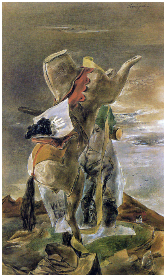
Figure 8. Yasuo Kuniyoshi, Headless Horse Who Wants to Jump (1945). Oil on canvas.