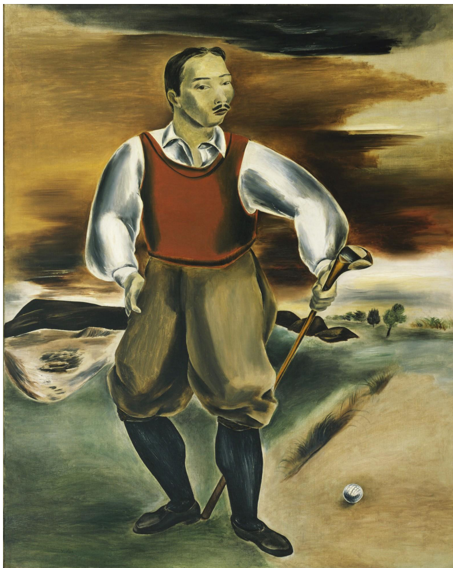
Figure 1. Yasuo Kuniyoshi, Self Portrait as a Golf Player (1927). Oil on canvas.

Blending Japanese idioms with American folk art, further influenced by European modernism, Kuniyoshi's oeuvre "exemplifies cultural hybridity and cross-fertilization." 15 His early still lifes, composite images of objects like signs in language, act as intimate portraits of personal history through iconographic references. Collecting American folk art was a way for Kuniyoshi to forge a relationship to American "roots." 16 Reciprocally, his early oeuvre seems to portray a "parallel bond to his native land through its folk art and folklore" through Japanese folk objects featured in his still lifes. 17 Furthermore, the context of growing interest in America for folk culture in the 1920s was related to a rise in racial nativism and increased xenophobia and intolerance. Kuniyoshi's art style, as it straddled modernism and regionalism, permitted him to become popular as an American artist, a glass ceiling otherwise very unlikely to be broken by a Japanese émigré.