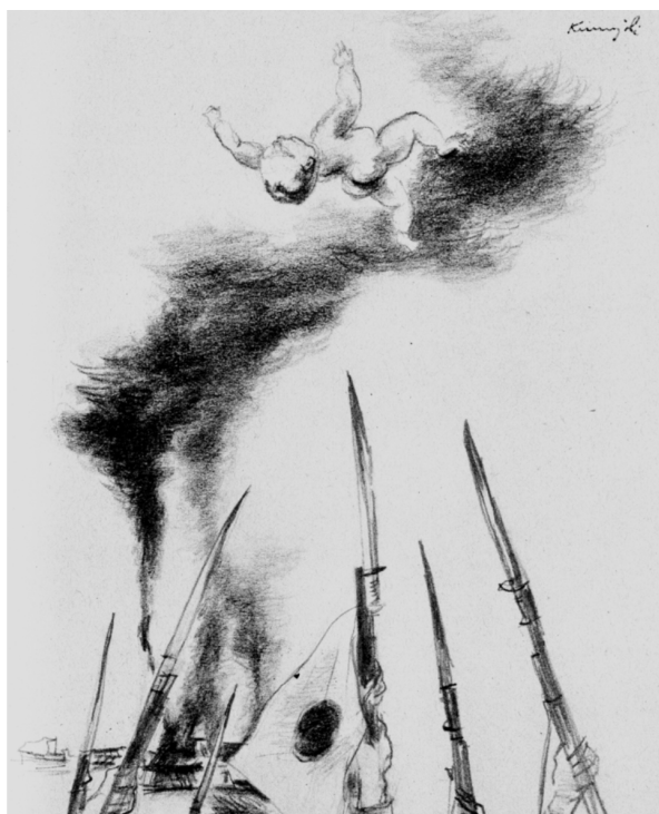
Figure 5. Yasuo Kuniyoshi, Untitled (Bayonets and Baby) , OWI Poster Design.