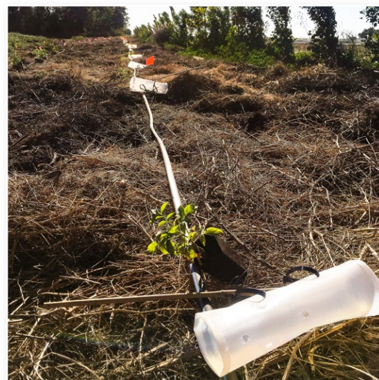
Figure 7. Blue elderberry seedlings in containers laid out for planting on Farm 1 in field demonstration trial. Seedlings were planted in holes punched through cardboard directly next to a 1-gallon-per-hour emitter. Pin flags and tree-protection tubes with bamboo stakes were used to mark and protect young plants.