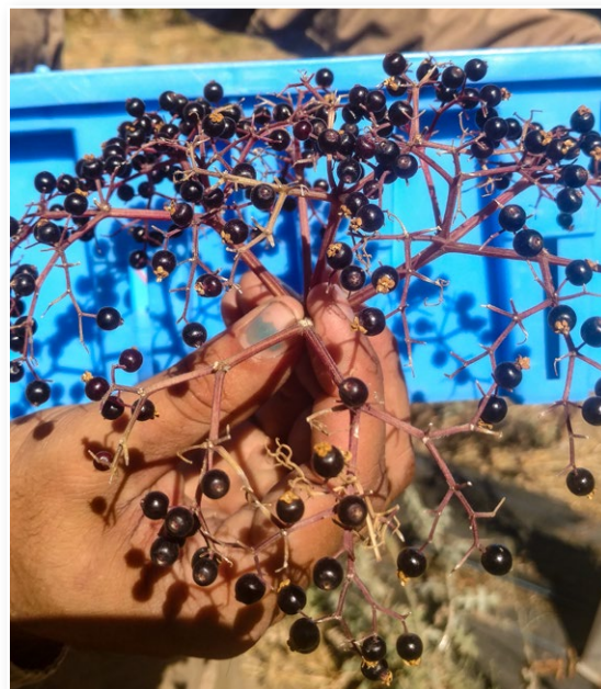
Figure 9. Ripe American elderberry cyme. During the field demonstration trial, ripe American elderberry cymes were frequently filled only partially, as shown here. Note the lack of a waxy white bloom on the surface of the berries, which is typical of American elderberries and distinguishes them from blue elderberries.

When just ripe, the berries of blue elderberry plants develop a dusty white bloom. As the berries continue to ripen on the shrub, the bloom will fade, leaving shiny, dark, blue-black berries (fig. 8). Blue elderberries can be harvested at any point after the bloom develops, but berries are generally sweeter and more evenly ripened if harvested after the bloom begins to fade. The berries of American (fig. 9) and European elderberry do not develop a bloom. Harvest whole cymes once all the berries in the cyme are blue-black. Cymes should not be harvested if any of the berries are