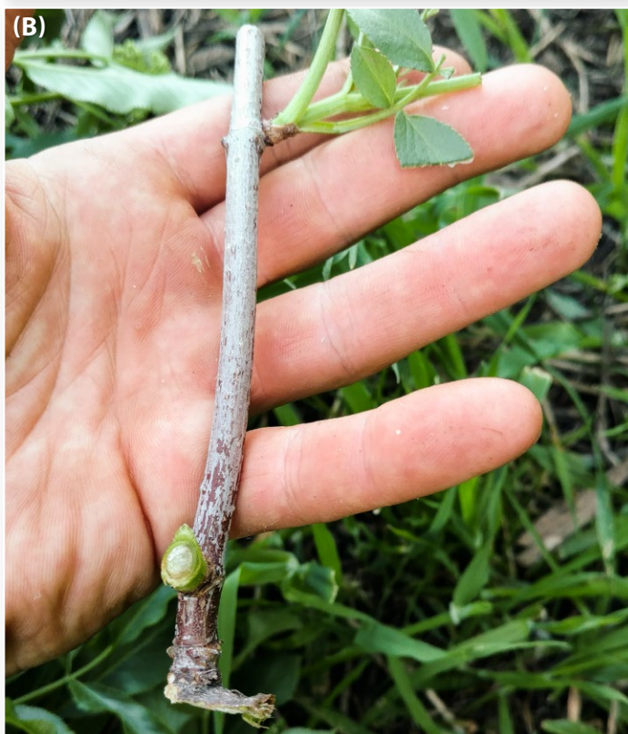
Figure 5. Heel cuttings of blue elderberry. When a side branch is cut partially through at its connection to the main branch, and then peeled away to leave a thin strip of bark from the main branch (A), a heel cutting results (B). The heel end should be treated with rooting hormone for greatest chance of success.