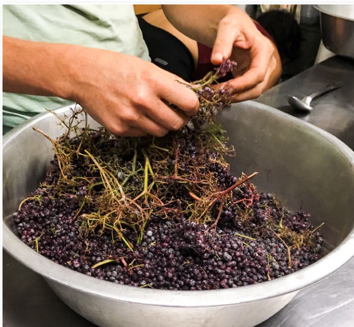
Figure 10. Destemming frozen berries by hand.

Unfortunately, medicinal components of elderberries also break down during processing (Senica et al. 2016). Processors must balance the need for heat application to reduce sambunigrin levels with the desire to maintain medicinal anthocyanins and other compounds.