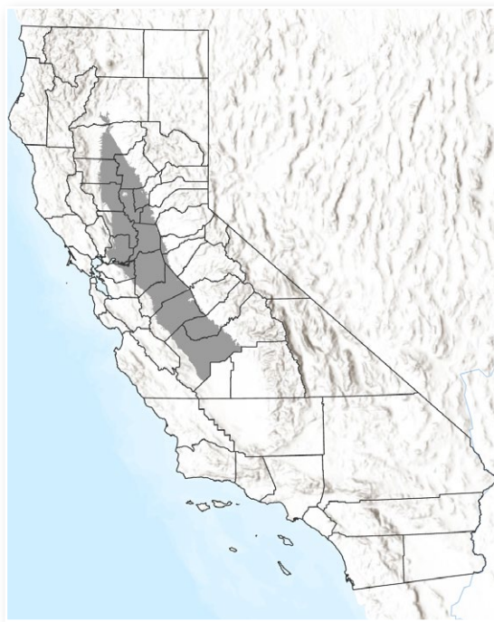
Figure 12. Map of California, showing the area of the Central Valley below 500 feet in elevation—also the suspected range of the valley elderberry longhorn beetle. Note: This map is provided for general reference only and is not to be construed as a definitive determination of the presence of the valley elderberry longhorn beetle. For specific guidance on the presence of the valley elderberry longhorn beetle in any specific area, contact local officials of the U.S. Fish and Wildlife Service.

Harvesting of flowers or berries is not restricted in any way. Due to restrictions on trimming and removing plants, producers wishing to grow blue elderberry are advised to limit planting of elderberry to hedgerows, where the plants become part of a permanent conservation feature with no expectation that major pruning or whole-plant removal will be required in the foreseeable future (unless the land has been entered into a programmatic safe harbor agreement).