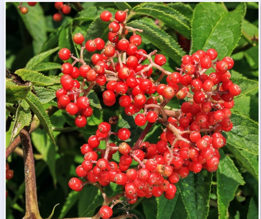
Sidebar 1 figure 1. Red elderberry cyme, showing the distinctly red color of the berries and the more conical shape of the cluster.

Those who wild-harvest or propagate from local wild plants in California should take care to avoid the toxic red elderberry ( Sambucus racemosa var. melanocarpa ). A California native, red elderberry is found in northern coastal regions and in the Sierra Nevada. The most reliable way to distinguish red elderberry from blue elderberry is by the color of the ripe berries. As its name suggests, red elderberry's fruit is bright red when ripe. Flowers can also be used to distinguish the two species: Red elderberry flowers are borne in cone-shaped clusters, in contrast to the blue elderberry's large, flat cymes (CNPS 2021c) (sidebar 1 fig. 1).