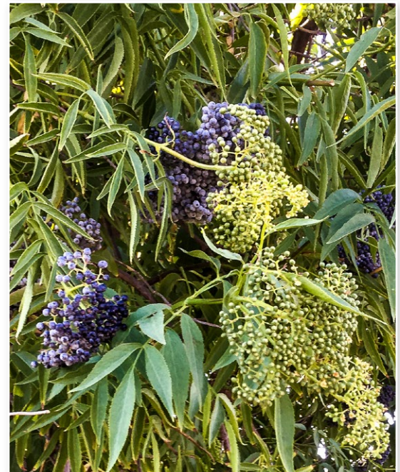
Figure 3. Close-up of a mature blue elderberry shrub during the summer harvest season. It is common to find ripe and immature fruit side by side, especially early in the harvest window, because blue elderberry sets fruit successively over a relatively long period of time.