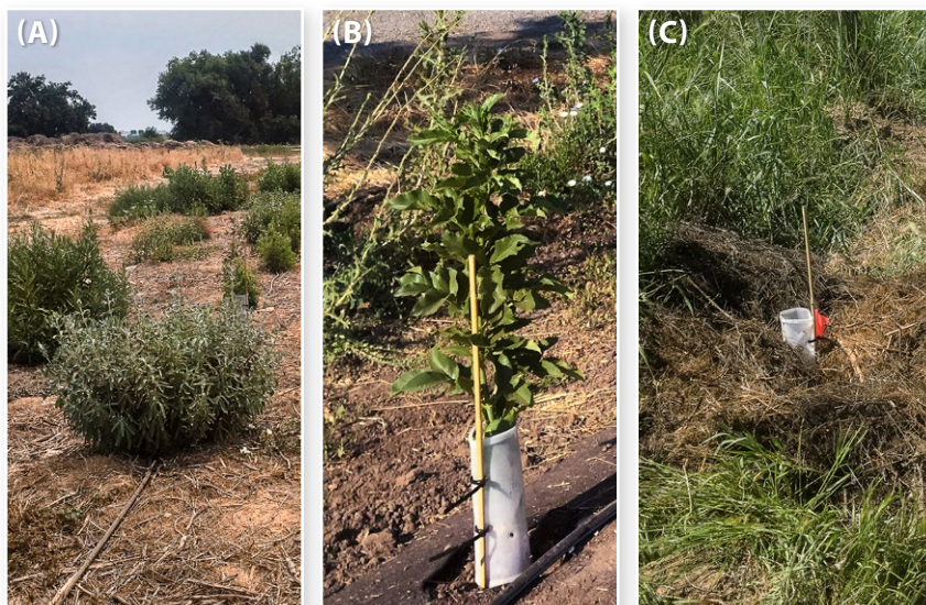
Figure 6. Organic mulch and plastic landscape fabric used on farms in the field demonstration trial during the first growing season. Farm 1 (A) laid a thick layer of partially decomposed asparagus fern on top of cardboard. Farm 2 (B) elected for woven plastic landscape fabric. Farm 3 (C), like Farm 1, used cardboard and partially decomposed asparagus. By winter after the first growing season, weeds had begun to germinate in the organic mulch at Farms 1 and 3—and at Farm 3, unmowed vegetation surrounding mulch circles easily overtook young plants. At Farm 2, the plastic fabric effectively suppressed weeds throughout the first 2 years after planting.

Once the hedgerow is established, continued attention to weed control and any potential pest issues is recommended—especially during the first few years, until the plants have filled out the space. Pruning is not essential for strong yields and has not been studied much in blue elderberry, but may also assist in reaching the grower's goals (see the section on pruning that begins on p. 14).