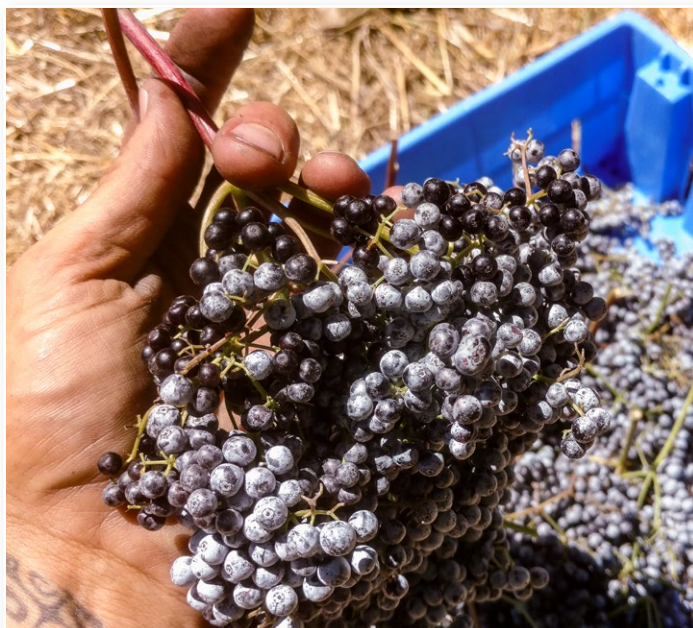
Figure 8. Ripe blue elderberry cyme harvested from an established blue elderberry shrub in Yolo County. Note that the waxy white bloom, which causes the berries to appear blue, has begun to fade around the edges of the cyme, revealing glossy, dark, purple-black berries. Cymes like these are more fully ripe than those whose bloom has not yet begun to fade.

California blue elderberry growers should check whether the site where they plan to plant elderberry falls within the range of the endangered valley elderberry longhorn beetle (see the section on elderberry and the Endangered Species Act, starting on p. 19). If the site falls within that range, pruning should be restricted to wood with a diameter of 1 inch or less, and should only be performed in the months of November to February.