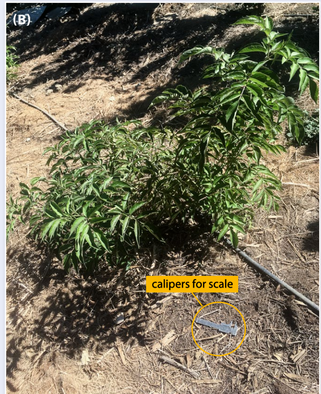
Sidebar 2 figure 1. Blue elderberry seedlings grew more vigorously than rooted cuttings of American elderberry cultivars Johns and Adams at field sites. Shown here are one blue elderberry (A) and one American elderberry plant (B) late in their first growing season. See the calipers on the ground, and poplar trees in the background of panel A, for scale.