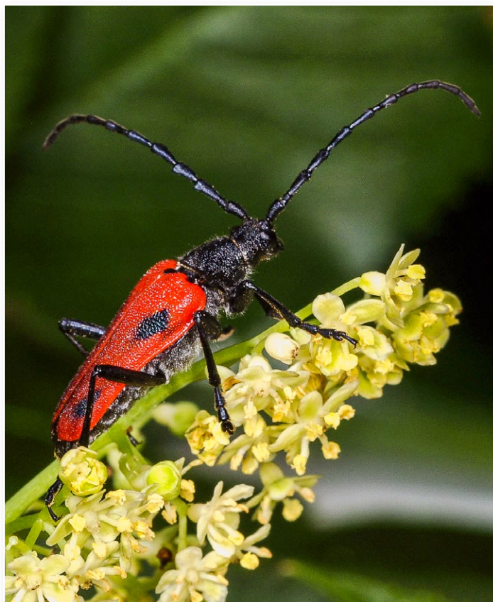
Figure 11. Adult male valley elderberry longhorn beetle.

Note: This table shows average the amount and cost of harvest and destemming labor per pound of destemmed berries, where labor costs $15 per hour. Frozen berries were destemmed by hand. Harvest labor includes orchard ladder use. Berries were harvested by hand-plucking whole berry cymes. For a more complete accounting of costs of establishment and early returns in three elderberry hedgerow styles, refer to UC Davis Cost and Return Studies, coststudies.ucdavis.edu , and search for “blue elderberry.”