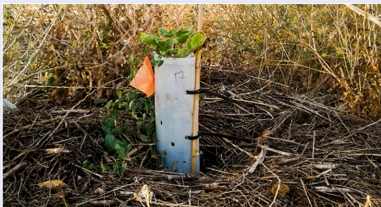
Sidebar 3 figure 1. Elderberry seedling in October after spring planting, surrounded by tall weeds. This planting limited mulching to a 3-foot radius around plants.

The lack of early growth at the first farm was compounded by the farm's approach to weed management, which entailed placing cardboard and crop-residue mulch around each plant in an area whose diameter was 3 feet. The other two farms placed mulch across the entire hedgerow surface area. During the winter rainy season following planting, the first farm experienced such tall weed growth in the unmulched ground between elderberry plants that some of the small plants became entirely engulfed in weeds 6 feet tall (sidebar 3 fig. 1). The resulting stresses likely contributed to a rate of plant death during the rainy season three times greater than the death rate during the summer growing season. Although many elderberry plants survived these challenging conditions and continued to grow over the next summer, these setbacks could likely have been prevented with some tillage and more extensive mulching.