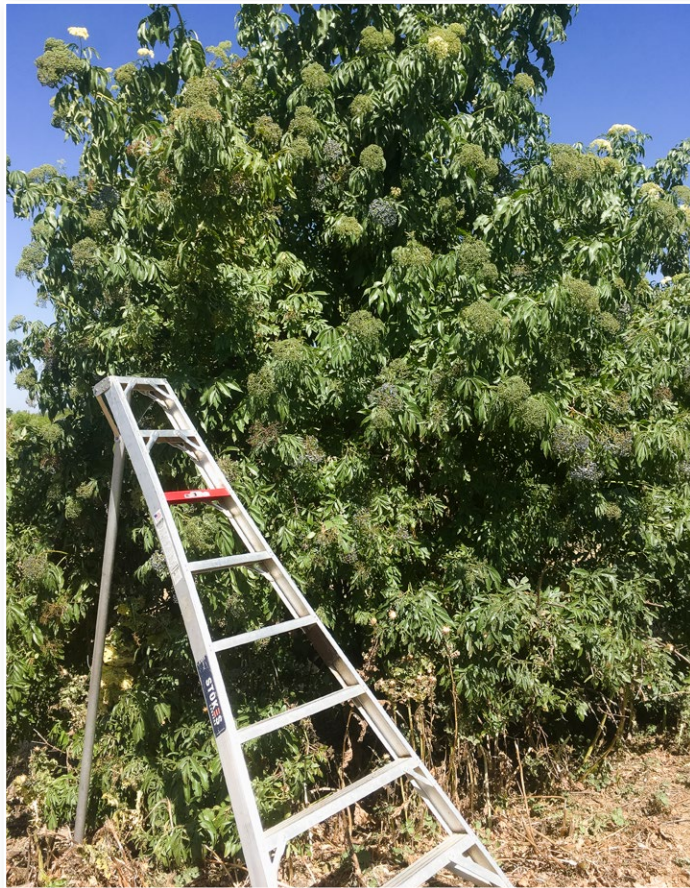
Figure 4. A mature blue elderberry shrub planted in 2012, with an 8-foot harvest ladder for scale. This shrub was harvested weekly in 2018 and 2019 as part of the field demonstration trial discussed in this article.

Elderberry in California hedgerows can be planted alone or in combination with other plant species. If blue elderberry plants are planted in a single line or with other large shrubs, recommended spacing ranges from 4 to 8 feet for denser hedges (Earnshaw 2018) and up to 15 feet for larger plants in a lower-density hedgerow (Long and Anderson 2010). Elderberry plants spaced at least 15 feet apart are more likely to approach their maximum size of 20 to 30 feet wide (CNPS 2021a); spacing plants more than 15 feet apart is an option that may increase ladder accessibility around the entire shrub. Small shrubs, forbs, and grasses can be planted between large shrubs, but may be shaded out eventually, especially with closer spacing of large shrubs. Smaller plants can also be placed in separate planting lines (Long and Anderson 2010; Earnshaw 2018) to prevent elderberry from shading them out. Alternatively, one can plant spreading species like yarrow, which will eventually migrate out of shady areas.