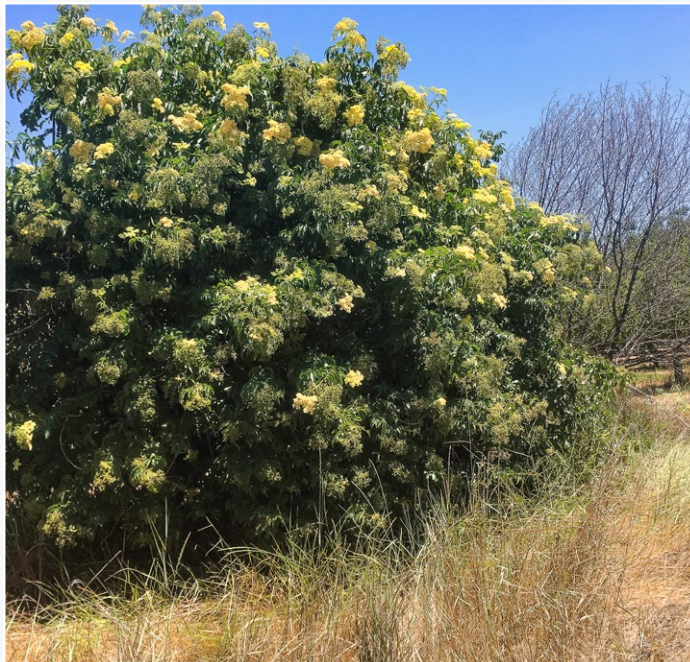
Figure 2. A mature blue elderberry plant in spring, when these California native shrubs are most easily recognized by their large, creamy flower cymes. The largest flush of flowers appears in spring, with the number of flowers gradually dwindling as the growing season progresses. A small number of flowers may continue to bloom as late as early October.

Although European and American elderberry are produced commercially, and practices for growing these species are relatively well established, limited formal or peer-reviewed information is available about blue elderberry from a production perspective. Therefore, this section draws on knowledge of experienced California elderberry producers, a 2018–2019 field demonstration of blue and American elderberry planted in hedgerows on California farms (Fyhrie et al. 2020), commercial