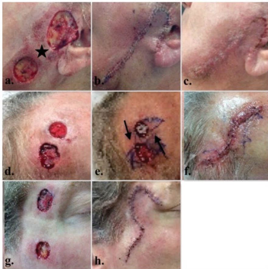
Figure 1. a) Case 1: Immediate post-Mohs; b) Case 1: Immediate post-reconstruction; c) Case 1: One week follow-up; d) Case 2: Immediate post-Mohs; e) Case 2: surgical planning; f) Case 2: immediate post-reconstruction; g) Case 3: Immediate post-Mohs; h) Case 3: Immediate post-reconstruction.