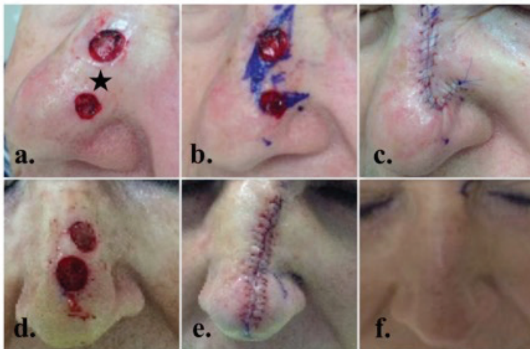
Figure 2. a) Case 4: Immediate post-Mohs; b) Case 4: Planned incision for a combination rotation flap closure; c) Case 4: Immediate post-reconstruction; d) Case 5: Immediate post-Mohs; e) Case 5: Immediate post-reconstruction; f) Case 5: One week follow-up.