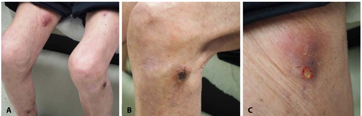
Figure 2. Histopathologic specimens from patient nodules. Superficial-to-deep suppurative inflammation. H&E, A) 25x, and B) 4x. C) Gram stain showing gram-positive cocci in clusters at high power, 400x.

Due to the presence of suppurative nodules along the lymphatic pathways of drainage, a diagnosis of nodular lymphangitis was favored. Classically, the infectious causes of nodular lymphangitis are Sporothrix schenckii , Nocardia brasiliensis ,