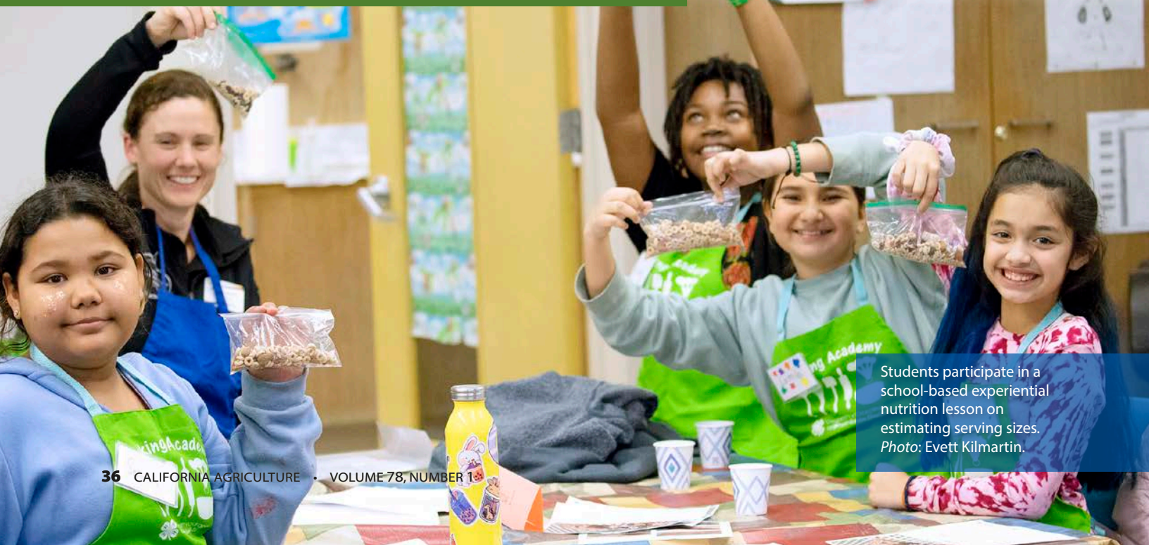
Students participate in a school-based experiential nutrition lesson on estimating serving sizes.

Childhood overweight and obesity are ubiquitous public health concerns requiring immediate attention (Pulgarón 2013). Recommendations made by state and federal agencies have highlighted the importance of schools in obesity prevention, particularly multi-component, coordinated programs (Hayes et al. 2018; Hoelscher et al. 2013). Due to the potential for sizable impact, integrating nutrition curriculum into schools may result in sustainable outcomes in reducing and preventing childhood obesity (Murimi et al. 2018). However, teachers are often reluctant to incorporate optional lessons due to limited instruction time to meet state and federal education standards (Jones and Zidenberg-Cherr 2015). Successful nutrition interventions often include age-appropriate curriculum, family engagement, identifying promising behavior for modification before starting the program, instructional fidelity (adherence to curriculum content and procedures), and substantial duration of six or more months (Murimi et al. 2018). Nutrition interventions that lack a multi-component approach and focus solely on direct education are less effective,