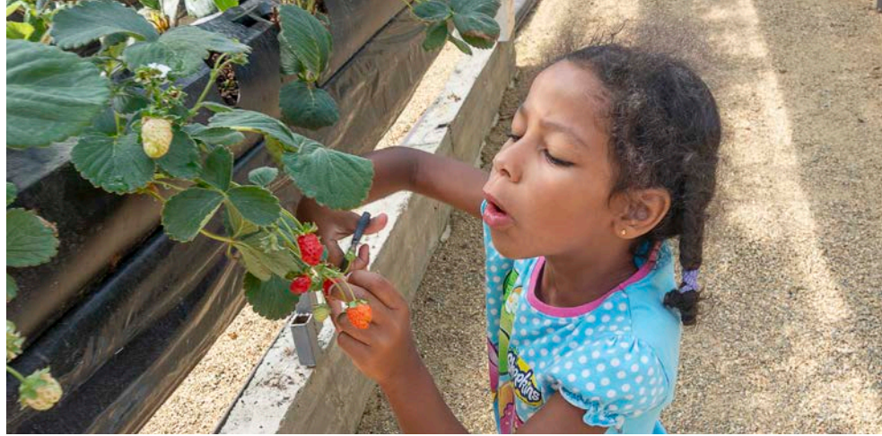
A student harvests a strawberry from a school garden.

The maintenance of the SHCP and observed behavioral outcomes were recorded to determine if positive outcomes were sustained. Annual trainings in pedagogical approaches and curriculum delivery were provided to ensure that CFHL, UC educators were familiar with program components. In addition to a multi-year implementation timeline, extender models and the