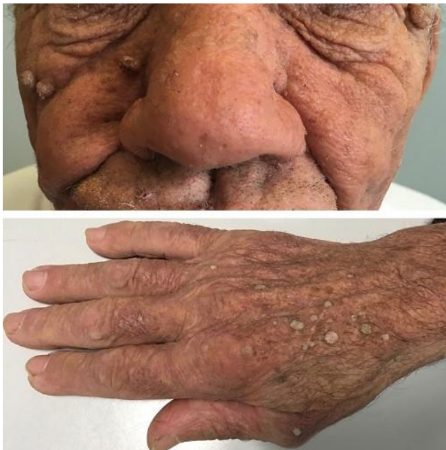
Figure 2. Hyperkeratotic warty papules on the cheeks and dorsa of the hands.

Histopathologic findings include papillomatosis and pronounced hyperkeratosis with irregular acanthosis. Epidermal vacuolization, parakeratosis, eosinophilic inclusions, or other typical microscopic features of common viral warts are not present [1-4, 7, 12]. Attempts to detect human papillomavirus DNA in skin biopsy specimens are negative [1-3],