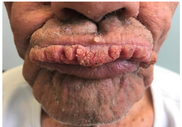
Figure 1. Confluent papillomatous lesions across the upper lip vermilion.

At our first consultation, the patient complained of fatigue and mild dysphagia. On physical examination, he exhibited confluent papillomatosis