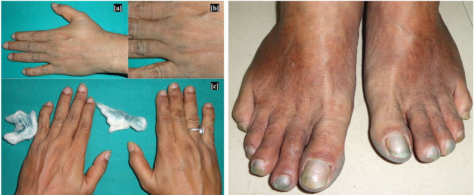
Figure 1. [a and b] Blue green discoloration over the hands. [c] Blue green color, wiped off by cotton. Figure 2. Blue green discoloration involving nails and feet.

The patient also noticed slight greenish coloration of undergarments. Examination revealed greenish discoloration over his hands, feet, and nails. {Figure 1 and 2}