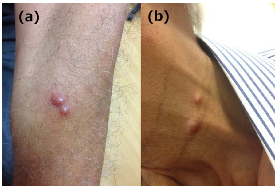
Figure 1: Erythematous papules and nodules on the arm and neck

A biopsy of a skin nodule on the hand revealed a dense lymphocytic infiltrate in the upper, mid, and lower dermis in an interstitial and perivascular pattern (Figure 2). The lymphocytes were medium to large in size with variable degrees of atypia and mitotic figures. Lymphocytic exocytosis within the epidermis forming small intraepidermal groups of lymphocytes was also seen. The epidermis also showed spongiosis and parakeratosis.