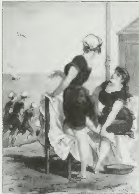
Fig. 7. ¿Por qué llaman esto El Sardinero? (Private Collection, Santander. Reproduced in Alonso Laza, 61). The marine theme is present in both male and female bathing suits.

Familiar colonial motives frame the representation of the beach as the scene of the Last Judgment and eventual Condemnation. Pereda’s character experiences the beach as an environment promoting “savage” customs: “Pues mire Usted, en medio de todo, no deja de gustarme esa franqueza salvaje que reina aquí entre ambos sexos” (453). Two symmetrical reminders of the New World frame the statement. “¿Por dónde se ve a la América?” the visitor inquired as soon as he saw the sea (449). Although his guide did not answer, the visitor insisted and asked again after he saw the steamer: “¿Vendrá de América, eh?” (453). Apparently, the view of the beach made the Castilian visitor feel himself in the colonies, no