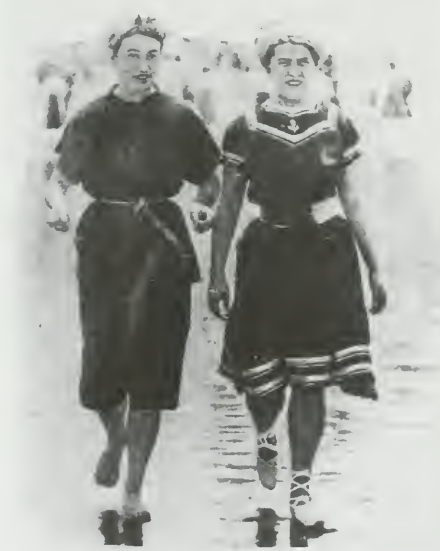
Fig. 4. Female bathers dressed as sailors, El Sardinero , end of 19th century

In “Las interesantísimas señoras” from Tipos transhumantes (1877), Pereda portrays a mysterious couple of young and well-dressed female visitors of a highland resort, who make the locals wonder about their nationality, language, civil and class status: “Como nadie las conoce en el pueblo, las conjeturas sobre procedencia, calidad y jerarquía, no cesan un punto” (II, 25). According to the narrator, there is no communication between the visitors and the local community. Spying, eavesdropping, and mythmaking mark this cultural encounter and make communication impossible. The ‘invaders’ use barbarisms ( aisé ), which the indigenous people try to interpret in order to understand the origin of the visitors. They wear exotic clothes, thus