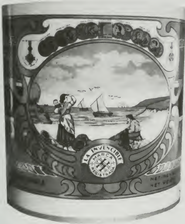
Fig. 3. Old-fashioned fishermen's community on a fish can from the 1940s (Reproduced in Homobono, 100)

The local population experienced the development of seaside resorts as a sudden closure of the sea, now separated from the mainland by fences and walls. From the socio-economic perspective, the creation of the sea bathing facilities was accompanied by the processes of privatization of public property — the seashore — and by transformations of traditional class relations. Seasonal visitors arriving to spend the summer by the sea joined the local bourgeoisie, bringing new forms of exploitation and making local businesses increasingly dependent on the strangers. 7 Very little is known about the ways in which lower classes perceived the modernization of the beach areas; on the other hand, the response of the local bourgeoisie and aristocracy to the new