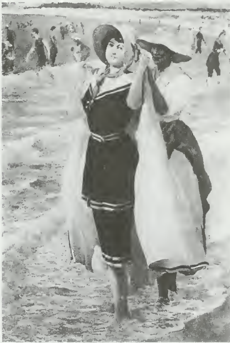
Fig. 5. The Bather and the Bañera , artist unknown. (The Zubieta Collection, reproduced in Gil de Arriba 1992, 110). The bather is dressed in a marine costume.

The perplexity of Escalante’s narrator in the face of the sudden confusion of gender and class behavior on the beach is characteristic of male beach narratives in general. Cultural taboos on showing certain body parts for upper class women, the age-old symbolization of the female body, the traditional notions of upper (i.e. permissible) and lower (i.e.