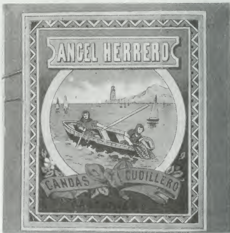
Fig. 2. Fisherwomen on a fish can from the 1920s (Reproduced in Homobono, 85)

Within Spain's marginal modernity, the development of the beach and the narratives accompanying it are particularly interesting because they give voice to local authors from Spain's own margin: its rural coastline, its border in flux. 6 As we shall see, some of these authors experienced the modernization of their native lands as a reversed colonial conquest, which stirred old discussions about the role of the Empire, the ownership of lands, and the balance of civilization and barbarity in modern culture.