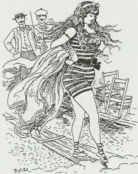
Fig. 6. Tha Coquette Bather . (19th century caricature, reproduced in Gil de Arriba 1992, 111.)

Gradually, the sight of the beach made the character reconsider not only the conventions of gender behavior, but also the class nature of the moral norms. On the lower class Second beach he inquired how the seemingly uniform space by the sea could harbor moral norms and dressing codes so different from one another: “¿Cómo es que hay tanto rigor en el otro arenal y en éste tanta tolerancia?” (454). His local guide gave no plausible explanation. The truth was, however, that when the former no-man's lands of the beach became private property, it was up to the owners to decide the regulations of dress codes and beach behavior. 22