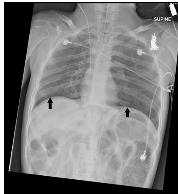
Figure 3. Chest x-ray performed after needle decompression of abdomen demonstrating improved diaphragmatic excursion (black arrows).