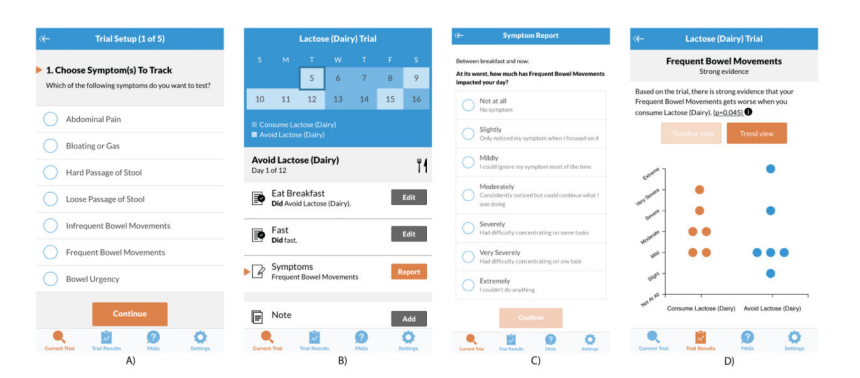
Figure 1. TummyTrials supports scientifically valid self-experimentation for identifying individualized food triggers, including: A) self-experiment configuration, B) daily prompts and reminders, C) compliance and symptom tracking, and D) analysis of results.