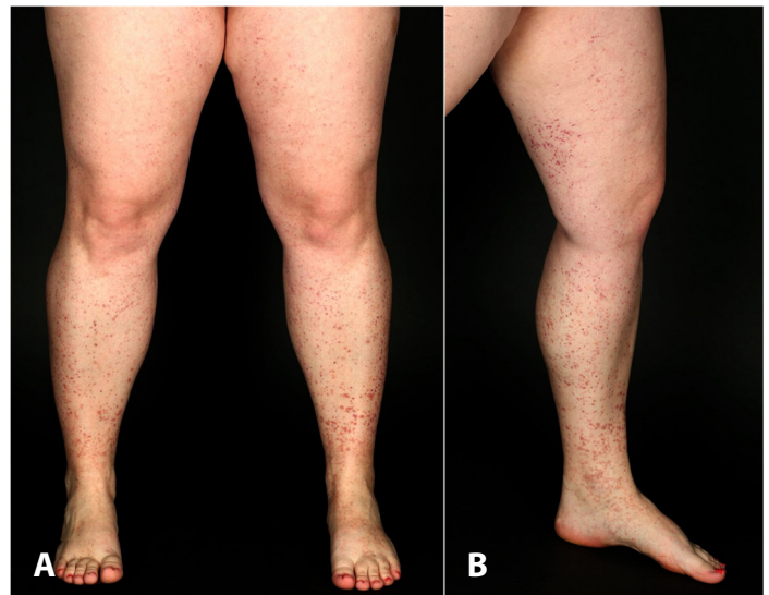
Figure 1. A) Overview of both lower extremities with disseminated palpable purpuric papules. B) Left leg showing the extent of the papules.

A 31-year-old woman presented to our outpatient department with multiple palpable purpuric papules disseminated on her legs, lower arms, and lower abdomen ( Figure 1 ). The papules first appeared on her legs together with fever one day after her second Pfizer/BioNTech vaccination. The flare had been treated by her primary care doctor with a low dose of 5mg oral prednisone. After an initial improvement she noted a quick recurrence and progression of the papules to the lower abdomen. She denied any other complaints, infections, or medication. Her medical history was unremarkable. We admitted the patient for further diagnostics and treatment.