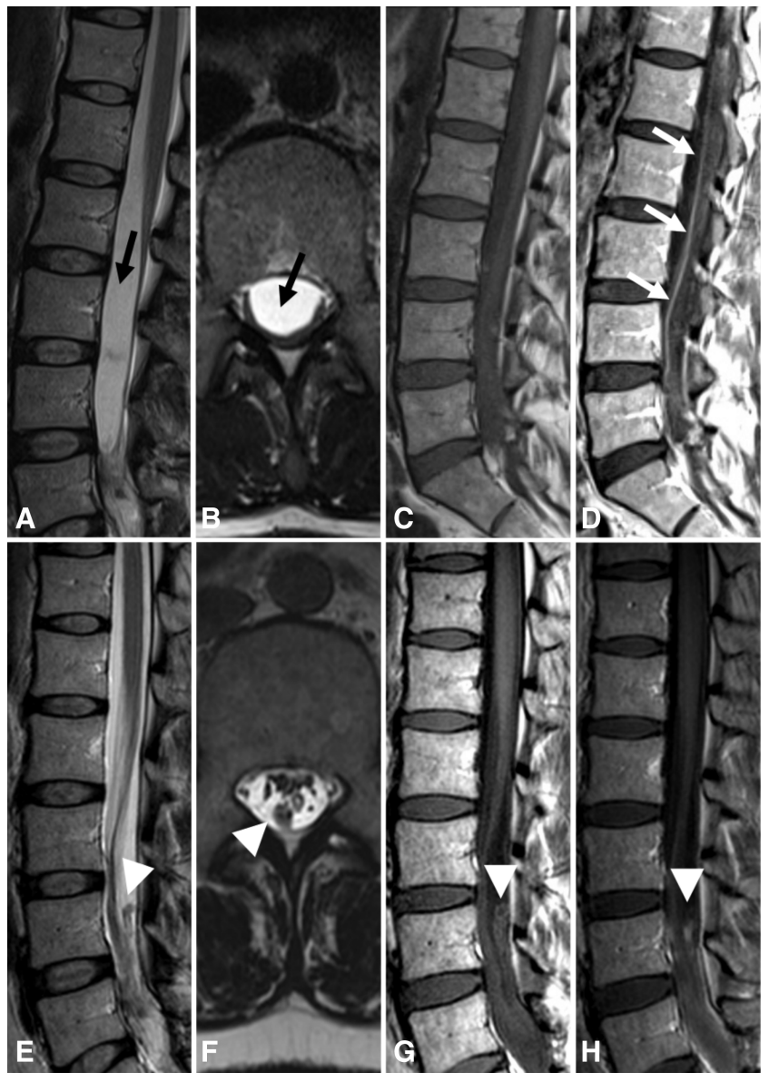
FIGURE 2: Lumbar spine magnetic resonance imaging (MRI) findings. (A, B) MRI of the lumbar spine in 2015 showed a cystlike structure in the lumbosacral sac ( black arrows ) seen on sagittal (A) and axial (B) T2-weighted images. (C, D) Repeat MRI in early 2017 showed clumping of the nerve roots of the cauda equina and enhancement of the nerve roots on postcontrast T1-weighted images (D, white arrows ) compared to precontrast images (C). (E–H) In late 2017, soon after a symptom flare, lumbar spine MRI showed an extramedullary, intradural nodule ( white arrowheads ) on T2-weighted (E, F) and T1-weighted (G) images, which demonstrated contrast enhancement (H).

in her arms. Treatment of pain with pregabalin was minimally effective and caused drowsiness. Her pain responded to nonsteroidal anti-inflammatory drugs.