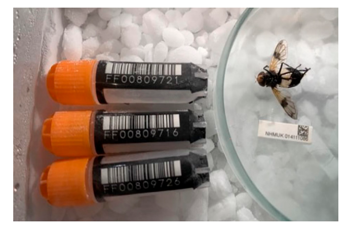
Fig. 1. An example of the documentation that should occur as a sample is being processed. The SPECIMEN_ID (the Natural History Museum, London [NHMUK] barcode under the fly) is photographed alongside the specimen and the barcoded tubes into which different samples of that specimen will be placed. The metadata tracking sheet would have three entries for this fly, where collection-related information would be identical, but tissue type and tissue size would vary (e.g., head, thorax, and abdomen, each in a separate tube).

Quantitative assembly standards. Where sufficient DNA and material is available from a single individual (or clonal colony), currently more than around 100 ng DNA per gigabase genome, we propose a minimum reference standard of 6.C.Q40 (i.e., >1 Mb NG50 contig continuity and chromosomal scale NG50 scaffolding, with less than 1/10,000 nucleotide error rate (see SI Appendix , Table S1, taken from ref. 10, for notation and further information). When the chromosome NG50 is smaller than a megabase this will be C.C.Q40, with "C" denoting having achieved full chromosome lengths. This standard is now