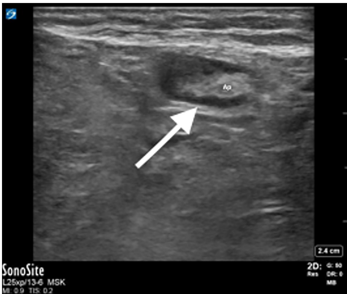
Image 2. Oblique view of appendix on ultrasound. Arrow pointing to fluid around the appendix. Ap, appendix.

appendix is contained within an inguinal hernia sac. 4 De Garengeot hernias are rare, accounting for 0.5-3% of all femoral hernias. 5,6 There are less than 100 known cases of de Garengeot hernias. 7 It is even more uncommon to have