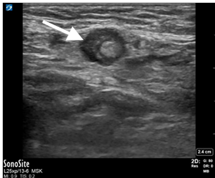
Image 3. Point-of-care ultrasound image of appendix with hypoechoic rim (arrow).

Documented patient informed consent and/or Institutional Review Board approval has been obtained and filed for publication of this case report.