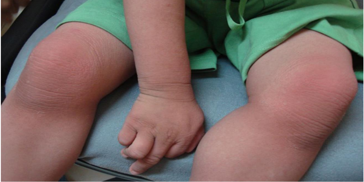
Figure 1. Sparse and light-colored scalp hair, sparse eyebrows, and photophobia. Figure 2. Palmar leathery-pebbly hyperkeratosis. Figure 3. Hyperpigmented and hyperkeratotic thickening of skin over extensor surfaces of joints.

He had some photophobia but eye examination was normal. He also had bilateral achilles tendon shortening with toe walking, which was corrected with surgery at the age of 3. Although two previous skin biopsies showed the presence of sweat glands, the patient had hypohidrosis and the mother described episodes of hyperpyrexia during summer months. Genetic analysis revealed the D50N missense mutation in the connexin 26 gene, which confirmed the clinical diagnosis of keratitis-ichthyosis-deafness (KID) syndrome.