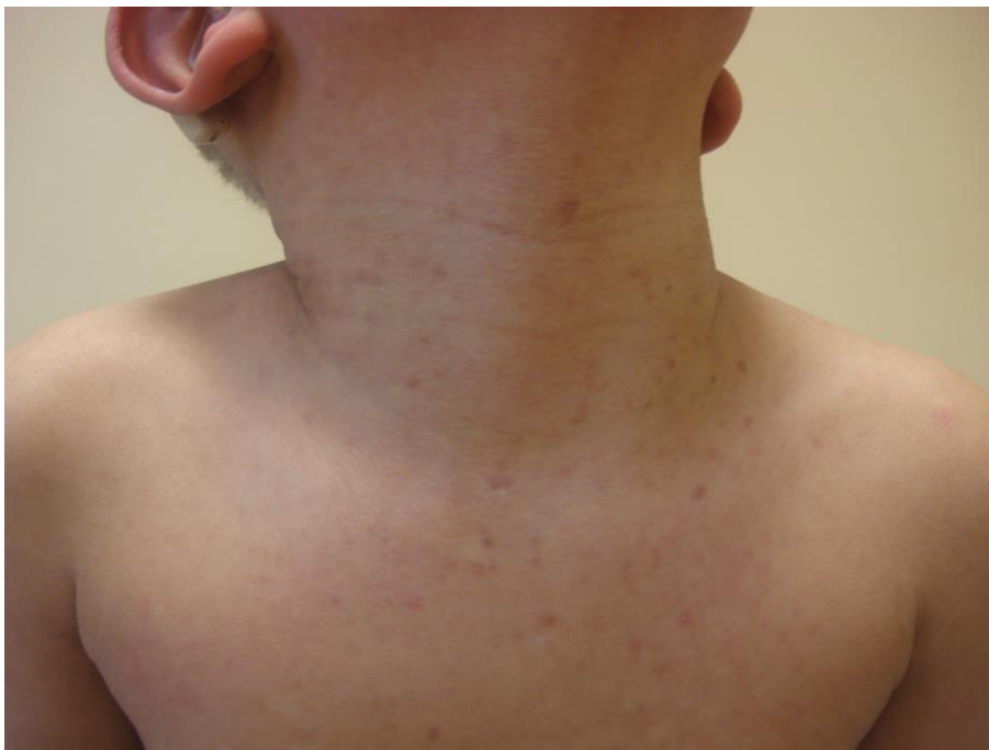
Figure 4. Erythematous, scaly papules over the anterior aspect of trunk and neck.

Histopathological examination of a punch biopsy revealed lichenoid dermatitis with hydropic degeneration of the basal cell layer, confluent parakeratosis, and dyskeratotic cells, confirming the diagnosis of PLC (Figure 5).