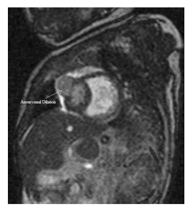
Fig. 3 Short-axis magnetic resonance image that demonstrates an aneurysmal dilation in the RV

the tricuspid valve was noted to have begun functioning with forward flow into the RV. The RV pressure continued to decrease to less than one-half systemic. The pressures in the left ventricle (LV) and aorta equalized. Because occlusion of the PDA resulted in inadequate pulmonary blood flow, a 4-mm central shunt of reinforced Gore-Tex was placed. Using a Doppler probe, it was found that on occluding the shunt, there was pulsatile forward flow from