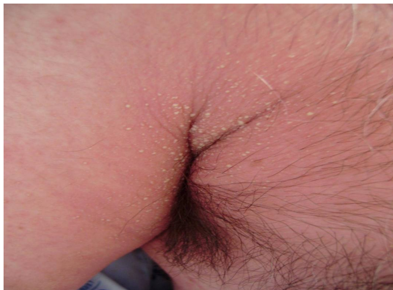
Figure 1. Raised bumps on the chest wall and arm, that are filled with pus (pustules). The skin under and around these bumps is reddish

To the best of our knowledge, this is the first case with the concomitant presentation of BSPDC, pseudohyperparathyroidism, and acute generalized pustular psoriasis. From a dermatological point of view, it is important to take into consideration the diagnosis of BSPDC in patients with generalized pustular psoriasis associated with severe hypocalcemia and epilepsy.