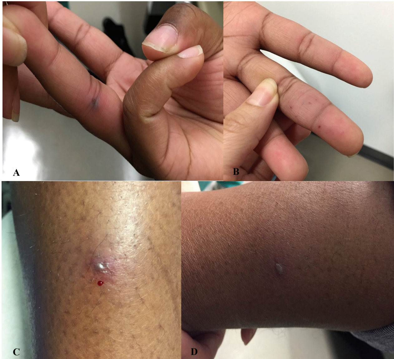
Figure 1. A) Side view of right fourth digit with purpuric papule with surrounding erythema. B) Scattered erythematous to violaceous petechial lesions on left fourth digit. C) Right lower extremity with hemorrhagic pustule with dusky center and peripheral erythema. D) Left lateral shin with hemorrhagic pustule and peripheral erythema.

on a deeply erythematous or hemorrhagic base [12, 15]. In light of the consequence of delayed diagnosis and treatment of DGI, healthcare providers should maintain an index of suspicion and recognize the clinical signs and symptoms associated with this condition. In particular, clinicians should be cognizant of the varying morphologies of cutaneous manifestations of dissemination. We present a case of an 18-year-old woman presenting with low grade fever, sparse hemorrhagic pustules, and joint pain. DGI was entertained and confirmed by blood cultures, skin biopsy, and urine Neisseria gonorrhoeae/Chlamydia trachomatis (GC/CT) probe. We go on to describe the clinical features, diagnosis, and treatment of DGI, including discussion of the