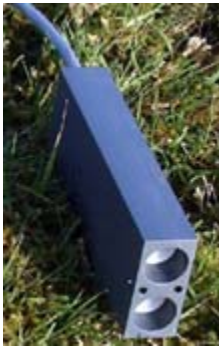
FIGURE 1 Double pyroelectric sensor developed by Eco-counter.

Existing information on the accuracy of the dual-sensor device is limited. The manufacturer claims accuracy within 5 percent (17), but acknowledges the device may miss adjacent pedestrians. An informal, 2-hour long check of the counter was undertaken by the Vermont Agency of Transportation (16) on sidewalks in the state capital Montpelier. It showed a high accuracy, since manual counts confirmed accuracy of 98%.