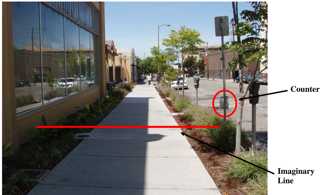
FIGURE 2 Data collection site 2 – low volume site.

The counter was installed perpendicular to the direction of pedestrian flow so that it could count pedestrians as they moved across an imaginary line on the sidewalk (Figure 2). The field observer and video camera were positioned very close (within a few feet) of the automated counter to ensure each crossing of the counter's path was recorded. Field and video observers also recorded a count any time a pedestrian crossed this imaginary line. Individual pedestrians could be counted multiple times if they crossed the imaginary line more than once. This could happen, for example, if an individual wandered across the counter's path three times while talking on a cellphone. In this case, the field and video observers would each count the pedestrian three times since the automated device would do the same.