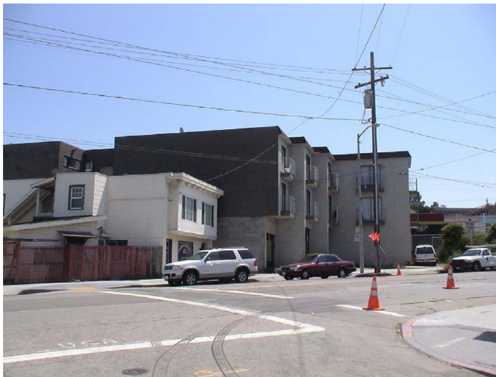
FIGURE 1 Camera angle used at Admiral Ave. and Mission St.