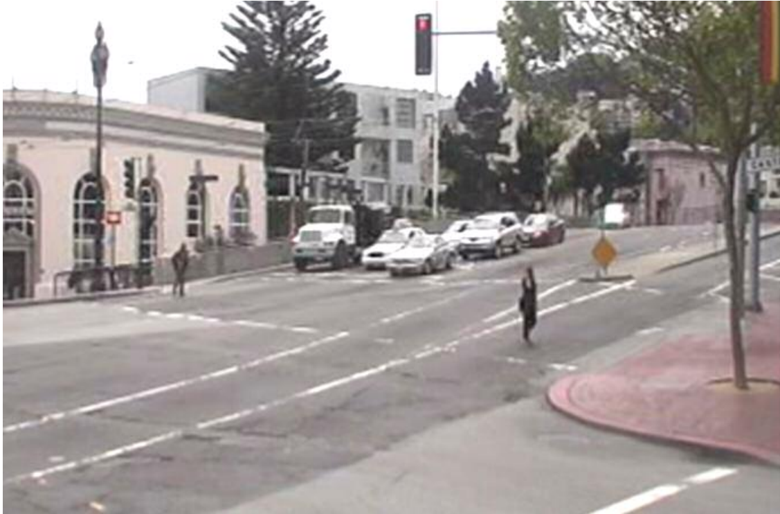
FIGURE 2 Camera angle used at Market and Castro (still from video tape)

Field data were entered into a Microsoft Access 2000 database. For quality control, all database tables were compared with the original field data sheets.