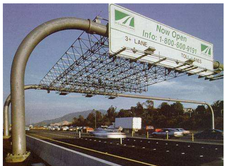
Figure 13 Self-Declaration Lanes for the SR-91 Express Lanes in Orange County<sup>10</sup>

In facilities with self-declaration lanes, users declare their occupancy status by driving through the designated HOV or SOV lanes at the tolling locations. Vehicles on the SOV lanes must be fitted with a transponder to pay the toll while vehicles using the HOV lane must have the required number of occupants to avoid being stopped by the highway patrol. Prior to the tolling point, users are free to drive in any lane. This type of configuration is used in Denver's I-15 HOV Express Lanes (Section 6.5) and is planned for the METRO HOT lanes project in Houston, Texas (Section 6.6).