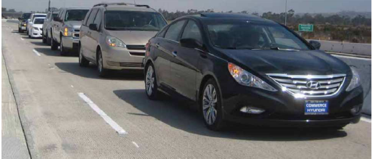
Figure 8 Test Platoon at Starting Location