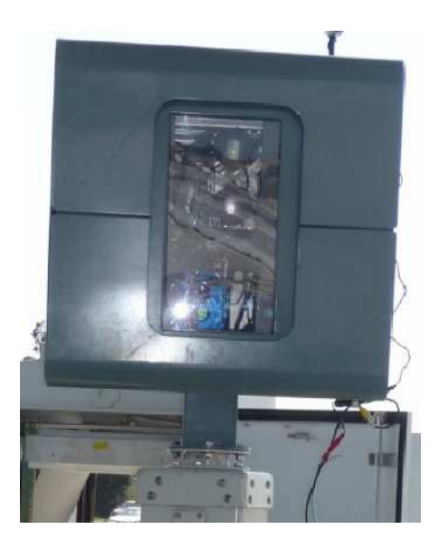
Figure 1 dtect Camera Installed at I-15

The dtect system is an infra-red camera and image processing unit designed to determine how many occupants inside a vehicle instantly. The device has a range of up to 50 meters, and is claimed to be effective on cars traveling at up to 80 miles per hour, eliminating the need for them to stop or even slow down. The dtect system operates by projecting two wavelengths of low intensity infrared light at the oncoming vehicle. As the beams are fired, each of two digital cameras, specifically coordinated to capture the infrared wavelengths, takes a photo. The accompanying software combines the two images and eliminates non-facial aspects of the photo before logging the picture with a printed timestamp, location and occupancy count. An instant after the process begins and the beams are fired, the final picture will be saved to the system's internal hard drive – with the faces masked with green blob to prevent an invasion of privacy. When the dtect system is correctly set up, and has an unhindered line of access to the windshields of oncoming automobiles, VOL claims that the accuracy rate of occupancy count is 90%. And in the ten percent of cases when it is mistaken, and challenged, the image in question can easily be examined by a human eye.