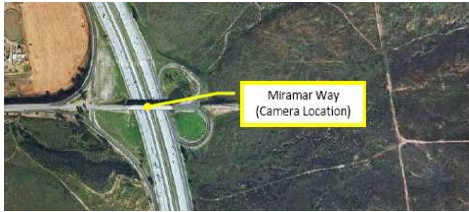
Figure 4 Miramar Test Location

Miramar Way of the Interstate I-15 is chosen as the testing site. See Figures 3 and 4. The I-15 Managed Lanes (ML) in San Diego, California is an expansion of existing high-occupancy toll (HOT) lanes known as the Express Lanes. The existing two-lane reversible Express Lanes facility had single entry and exit points at each end of an eight mile segment with a toll zone at the southern end. The new Managed Lanes will have four bi-directional lanes extending twenty miles in length and containing multiple intermediate access locations. The Miramar test location is at the southern side of the I-15 Managed Lane facility. This particular location has a two lane configuration that alternates directional flow based on a morning/afternoon schedule. The lanes are configured southbound during the morning peak and northbound during afternoon peak.