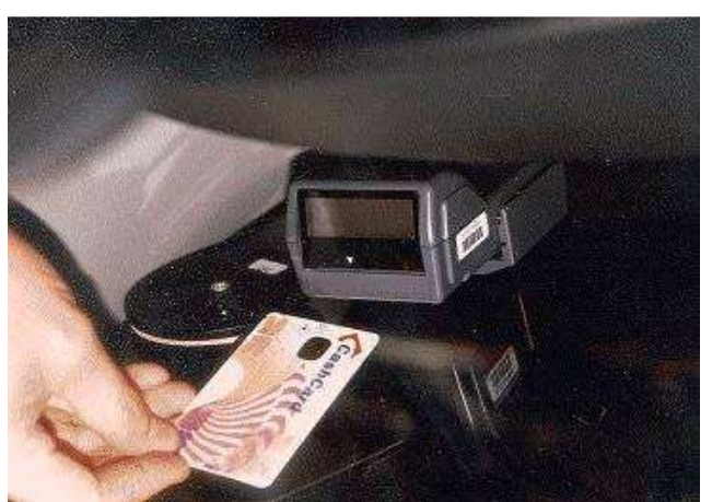
Figure 12 Smart Card OBU for the Electronic Road Pricing Scheme in Singapore<sup>9</sup>

Figure 11 shows the transponders that are selected for Utah's I-15 Express Lanes - the photo on the right shows a transponder in the SOV status (on) and the photo on the left shows the transponder on HOV status (off)<sup>8</sup>.