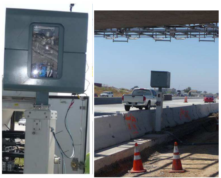
Figure 6 dtect System Roadside Installation