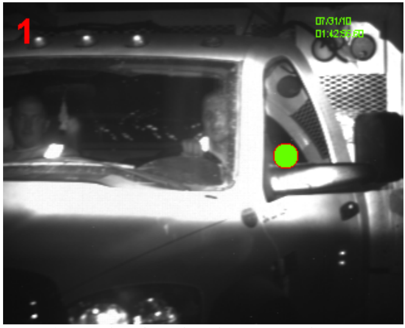
Figure 9 A Default Case for the dtect Camera

The initial review of logged images reveals a notable default behavior of the dtect system as shown in Figure 9. In many cases, the dtect system could not find any human facial features in the captured images, which by design prompted the system to provide a default output of one occupant and to place a green blob at a fixed location in the middle of the right-hand side of the image even if there is no occupant detected.