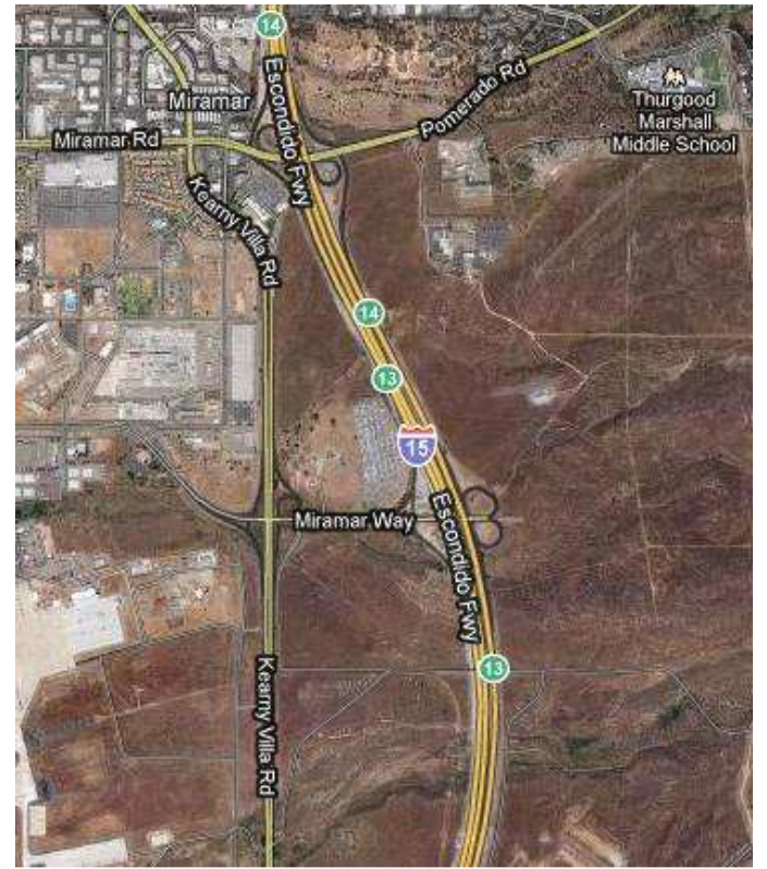
Figure 3 Test Site Vicinity Map