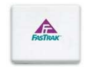
Figure 10 A Standard FasTrak Transponder for SOV Users<sup>7</sup>

Some toll facilities require single occupancy vehicles (SOVs) to declare their status by presenting a transponder while high occupancy vehicles (HOVs) with two or more passengers (depending on the number of passengers required by the facility) can use the facility without a transponder. Users without a transponder and the required number of passengers are in violation. Occupancy violations are enforced manually through visual inspection by the highway patrol and the use of electronic devices such as transaction status indicators (TSI), mobile enforcement transponders (MET) or automatic license plate recognition systems (ALPR). The SR-167 HOT lanes facility in Seattle, Washington employs this type of enforcement configuration (detailed in Section 6.1).