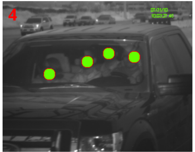
Figure 2 dtect Image Sample