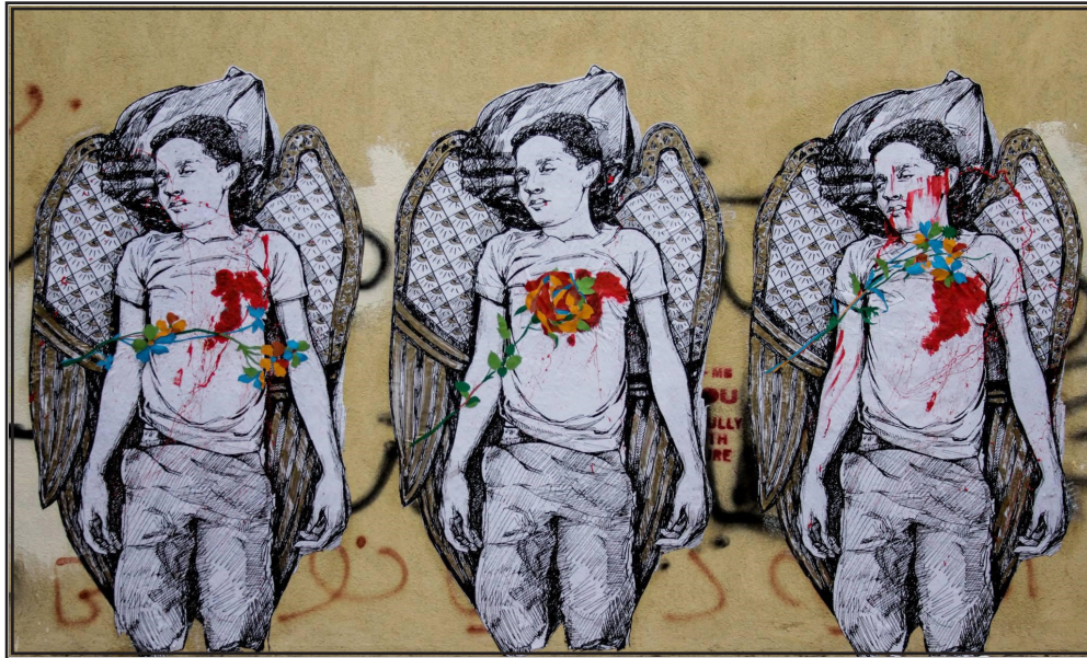
Source: Ammar Abo Bakr. 14 October 2013 Photo By: Abdo El Amir, from Hamdy and Karl, Walls of Freedom . p. 253

Not all of the memorials on Mohammed Mahmoud Street represent the martyrs' ways as peacefully as the portraits that utilize the color green. Another series of work, including a collaboration between Abo Bakr with El Zeft, an Egyptian street artist and revolutionary, display more graphic scenes of violence.