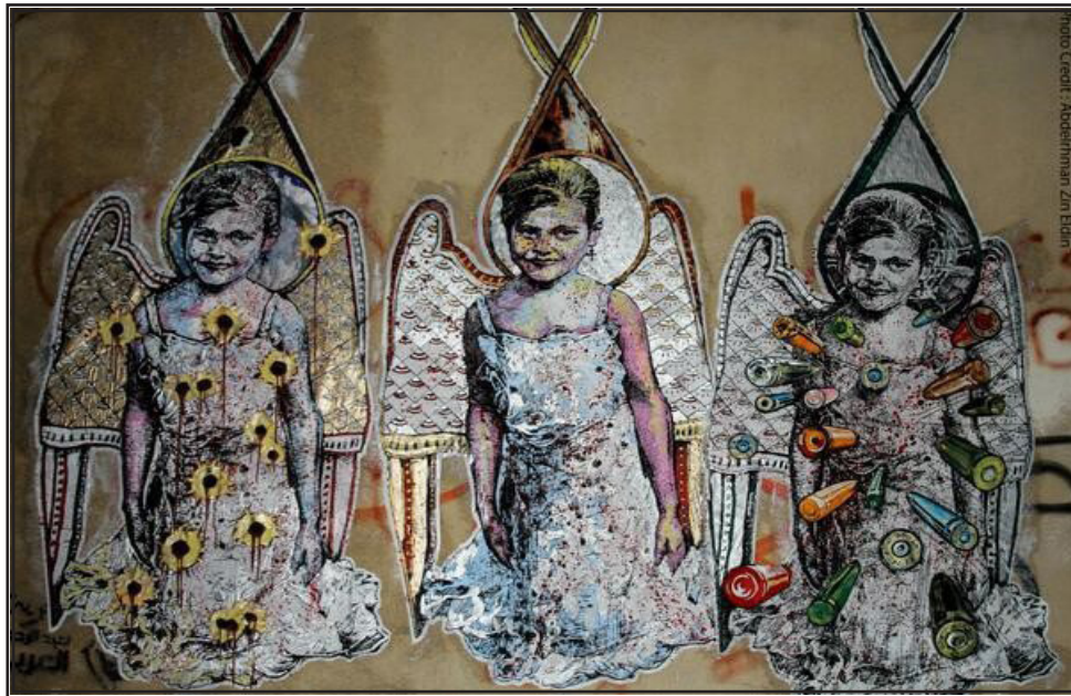
Source: Ammar Abo Bakr, Sabry Abou Alam Street, Downtown. 29 October 2013. Photo by Abdo El Amir. From Hamdy and Karl, Walls of Freedom . p. 254

reminiscent of angels and other Christian iconography with the utilization of wings, but extend the violence past an individual feature into a broader evocation of the sheer number of people who have died. The repetition seeks to emphasize this feeling; each image its own grave, while eliciting the infiniteness of rows of white crosses in war graveyards. Belal's own religion is unclear, although his death at a pro-Morsi rally is not insignificant.