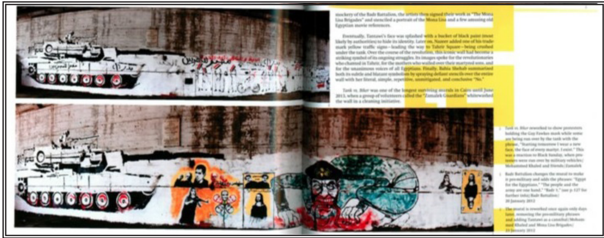
ILLUSTRATION 12b THE BADR BATTALION