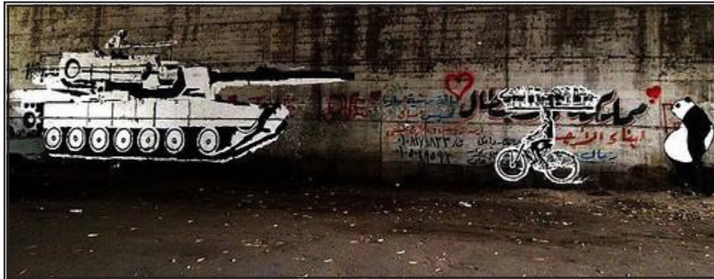
Source: by Ganzeer and friends with Sad Panda. 21 May 2011. Photo by JoAnna Pollonais. Image taken from Ibid. p. 66-67

However, such destruction did not deter the artists from returning. “As Egyptian authorities kept erasing the art by whitening the walls, artists responded with elaborated and sometimes improved versions of the previous paintings, until they excelled at the art of resisting, challenging, and insulting the counter-revolutionaries among with the wielders of power and their allies.” 72 Examining the lives of images—both their additions and their destructions—can help to understand not only government hegemony, but also the diversity of opinions in Egyptian society and the public’s relationship to such images. Therefore, “In order to have a clear understanding of history, one must not only look at the images that were preserved, but also examine those modified, appropriated, and destroyed,” whether it be by governmental forces or by citizens. 73