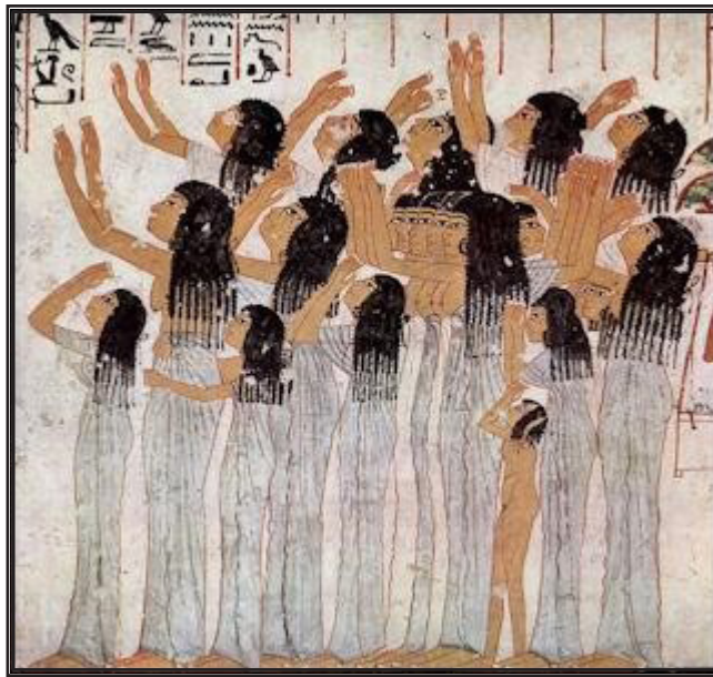
Source: Painted on the ancient Tomb of Ramose, Governorate of Thebes during the 18th dynasty. Image from http://factsanddetails.com/world/cat56/sub364/item1945.html

that Gamal Abdel Nasser and Anwar El-Sadat both used to supplement pan-Arab and pan-Islamic ideologies. 61 Considering the long history of promoting Egyptian cultural heritage to lure in an orientalist tourist market, and the succeeding implementation of prideful propaganda by Egypt's autocratic rulers, the remixing of Egyptian cultural heritage as a collective sign of mourning is particularly telling of the revolutionary culture surrounding the uprisings of 2011. In this way, "[t]he collective Egyptian imagination renews a sense of national identity by creatively reviving historical narratives of social and cultural memory in the present." 62 To illustrate this point, I will discuss one of Alaa Awad's murals below.