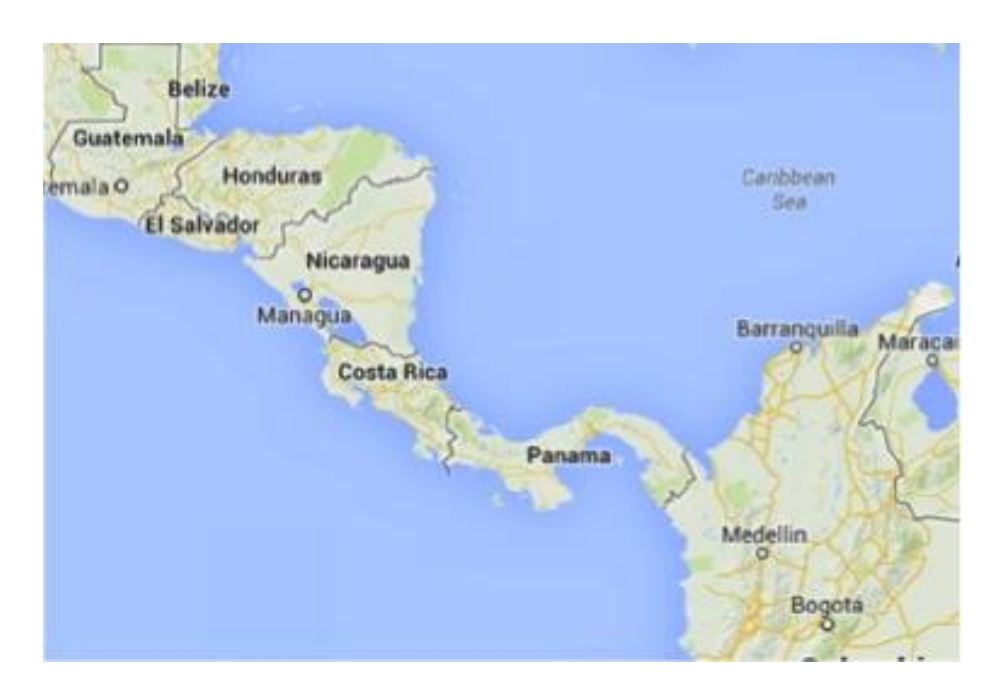
Figure 2. A map of Central America.<sup>[4]</sup> El Salvador borders Guatemala and Honduras.