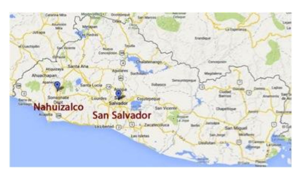
Figure 1. A map of El Salvador.<sup>[3]</sup> Nahuizalco and San Salvador are located in the western half of the country.