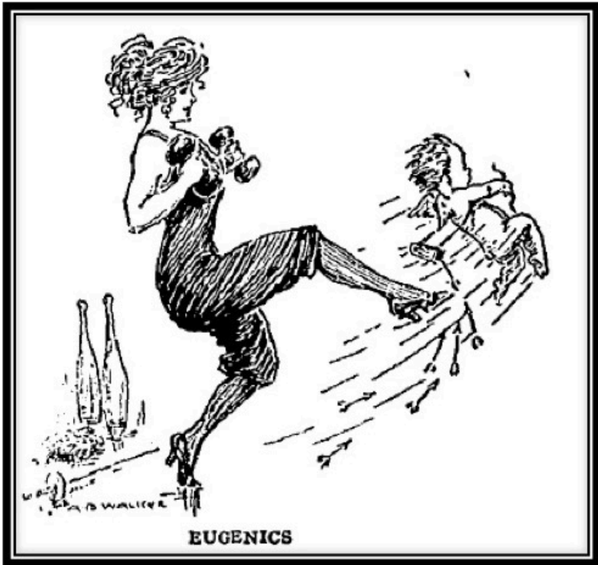
Figure 4: Walker, A. B. "Eugenics." Life , (Jan. 21, 1915).