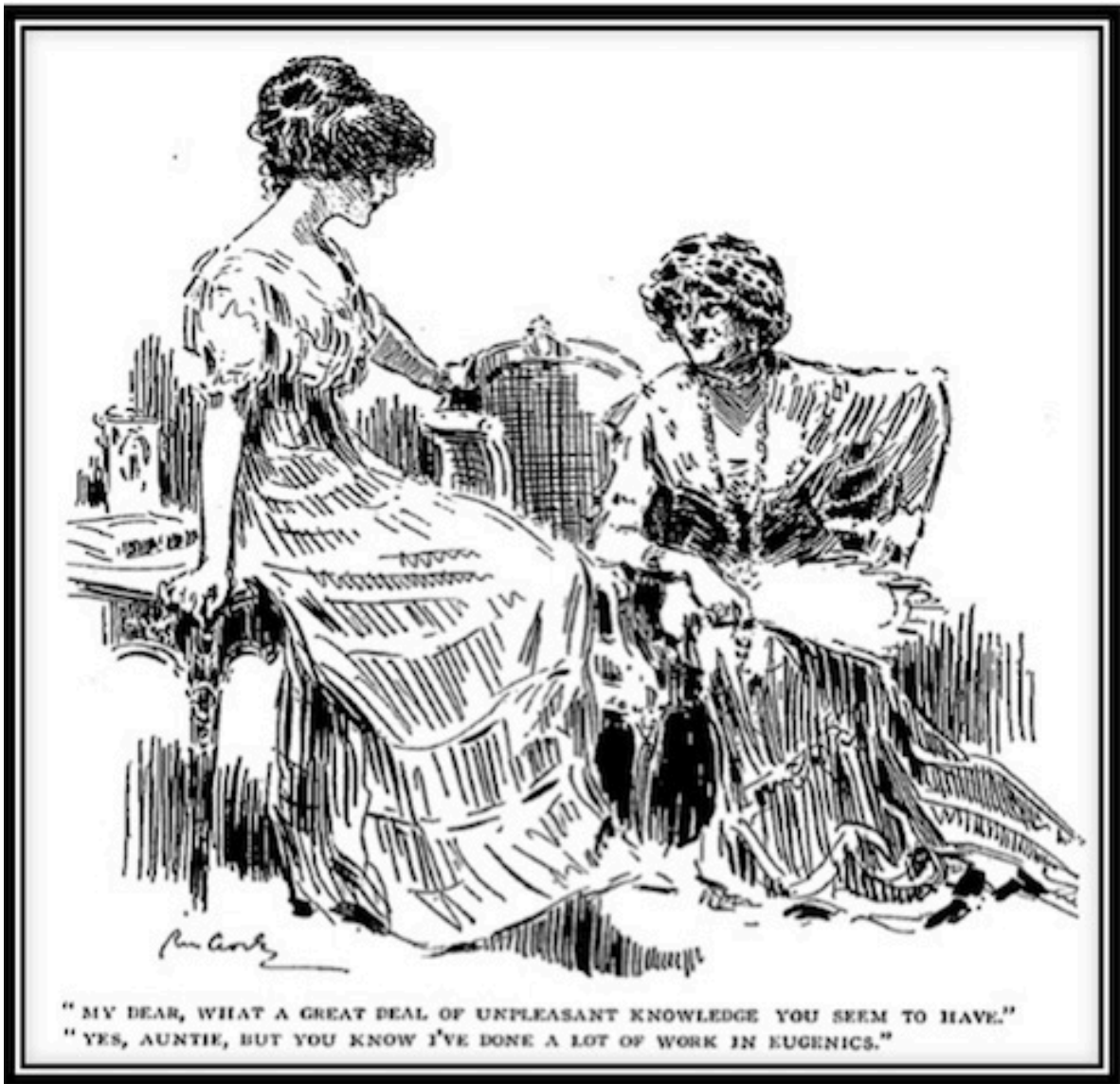
FIGURE 1: "UNTITLED CARTOON." LIFE, (MAY 15, 1913).