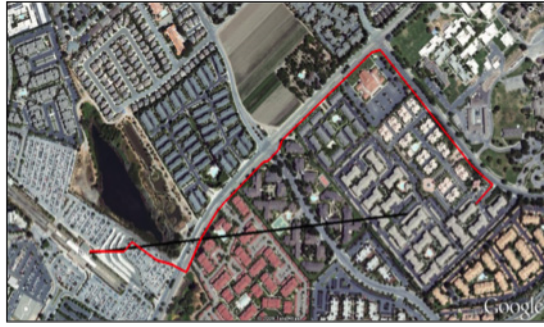
Left: Quatama apartments enjoy direct connection to Portland's MAX station; Right: An apartment with high parking demand also suffers from a circuitous shortest path (red line) relative to straight-line distance from the project's center to the Fremont BART station. (black line).