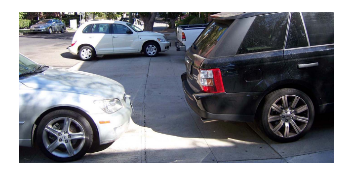
Fig. 4. Cars parked on the sidewalk in Los Angeles