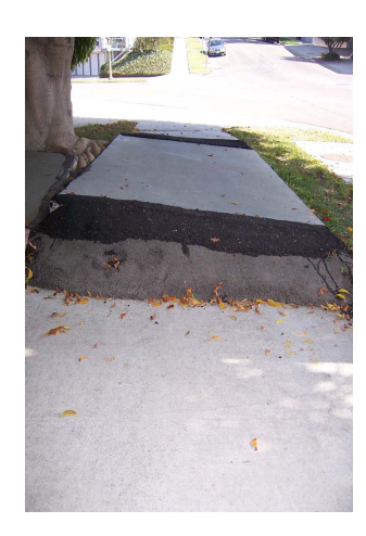
Fig. 1. Broken sidewalks in Los Angeles